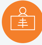
X-ray and radiology services